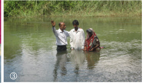
1. A house church in China studies the Bible together. Bibles are provided to them as gifts from partners like you. 2. Abandoned and neglected children are cared for, schooled and fed at the Sowers Ministry supported orphanages. 3. Water baptism is a clear testimony to the world.

Therefore go and make disciples of all nations, baptizing them in the name of the Father and of the Son and of the Holy Spirit - Matthew 28:19