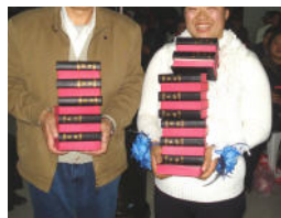
Bibles delivered to China's House Church leaders.