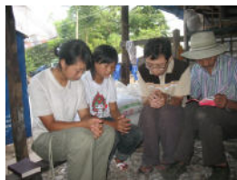
New converts are made disciples in China.