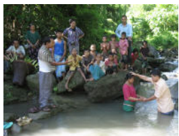
New souls are added to the Kingdom in Bangladesh.